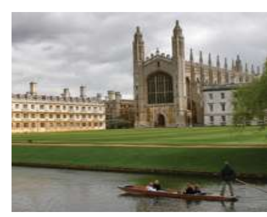
APPENDIX 5: Site visit report